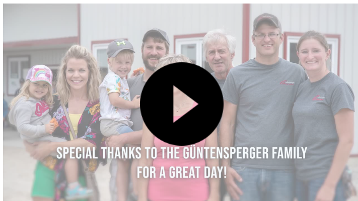
Guntensperger Dairy Open House Recap Video