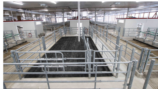
Custom Palpation Lane