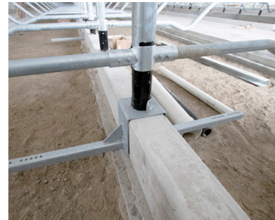
Custom Brisket Support