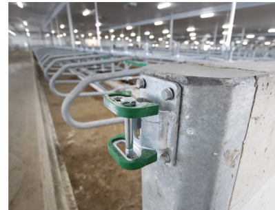
Bolt-On Instead of Standard Weld-On