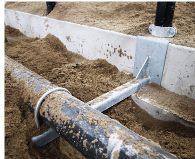
Custom Brisket Support