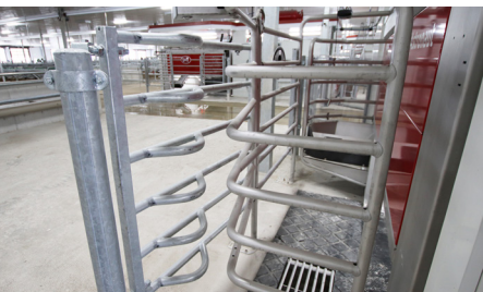
Standard DLS Robot Panel Set (Entrance)