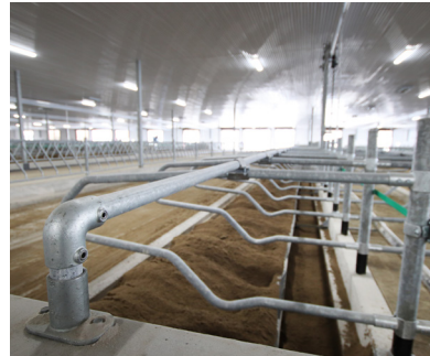
Custom Neck Rail Wall Support

For us, a big part of this project was to design and fabricate custom gating and hardware. Our in-house design and fabrication team has a great deal of experience working with custom fabrication items, and they worked closely with the Boersen family to meet the requirements of the new facility. Pictured on this page are several items that were custom made for this project as well as a few of our standard DLS fabrication items.