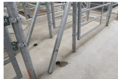
Removable Jourdain Octopost (Slides Into a HDPE Post Sleeve)