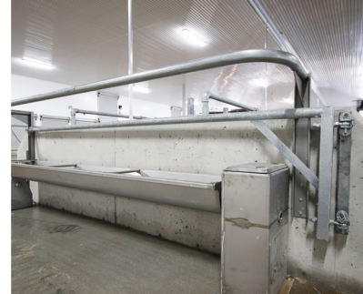
Standard Single Bar Swing Away Gate