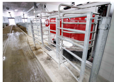
Standard DLS Robot Panel Set (Exit)