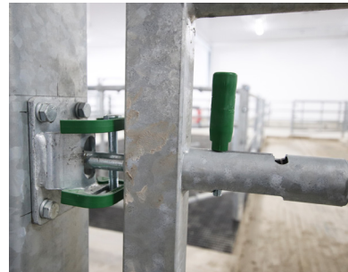
Bolt-On Instead of Standard Weld-On