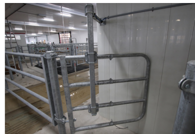
Standard DLS-Jourdain Sort Gate