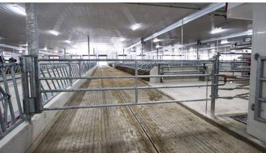
Custom Jourdain Self-Centering Gate with Stainless Insert