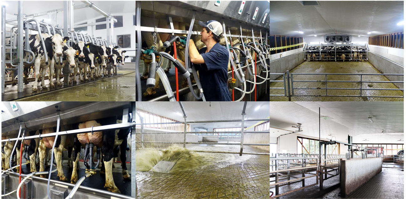
DLS STRUCTURE (HEIFERS) - 2020