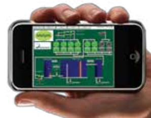
Continuous monitoring and diagnostics with alerts